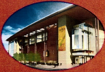
DBE & Procurement Committee