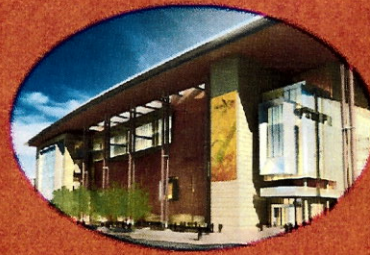
Finance & Audit Committee