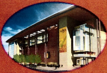
Marketing & Operations Committee